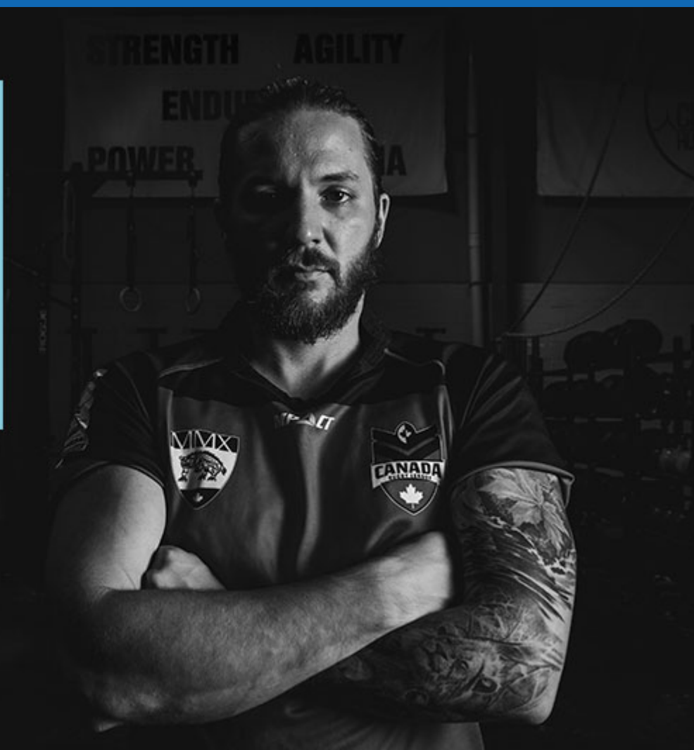
Rugby League star tackles MS head on